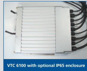
VTC 6100 with optional IP65 enclosure