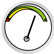
Battery Capacity Status