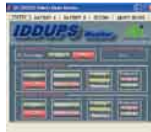
Battery Monitoring Utility