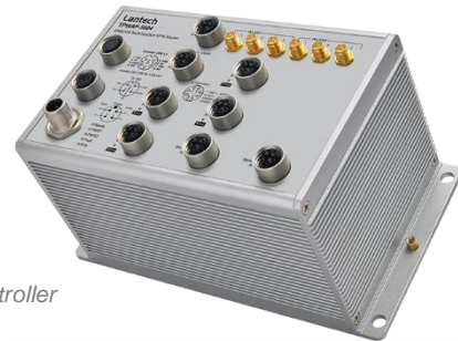
With 2 serial ports