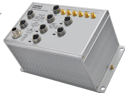
Without 2 serial ports