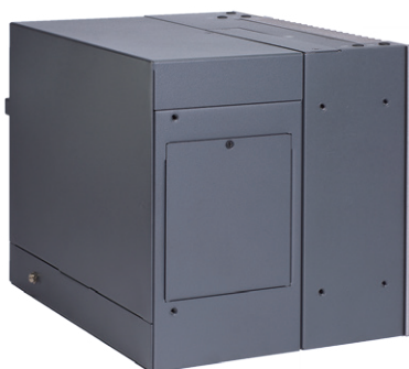
▲ Rear view